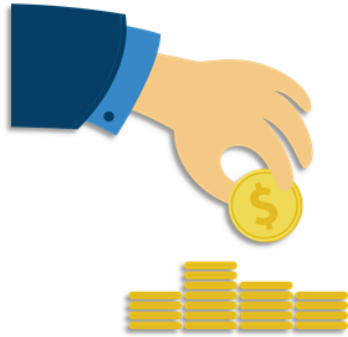
Figure 1: Top Contact Center Investment Drivers